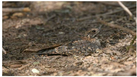
Standard-winged Nightjar (female)

The next stop is the 3-hectare Farasuto Forest Community Nature Reserve . Established in 2008 by local bird guides, it is home to over 100 species of birds. It is the only place in The Gambia where African Wood Owl can be reliably observed. In addition, the local guides know the resting places of the Standard-winged Nightjar. We manage to see both as well as a pair of Greyish Eagle-Owl.