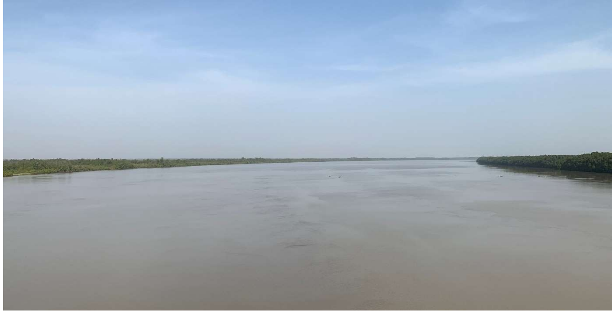
View from the Senegambia Bridge

North of Soma we cross the mighty Gambia. The river runs a total length of 1,120 kilometres – it is one of the main streams in West Africa. The Senegambia Bridge, opened in 2019, is the only bridge that connects the two parts of the country north and south of the Gambia. The bridge is very impressive. It's not listed in my 2018 Bradt travel guide so I was already wondering how we'd manage to take the unreliable ferry to the northern part of the country... Since there's no traffic, we can stop at the crest of the bridge and take in the view from a clear height of 20 meters.