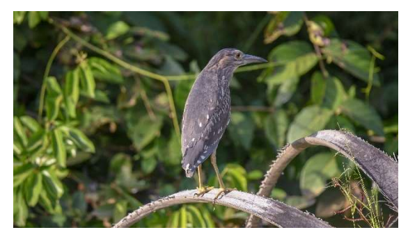
Black-crowned Night Heron