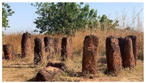
Wassu Stone Circles

After observing the Egyptian Plover we take our lunch break before continuing to Wassu . The stone circles of Wassu belong with other monuments in Gambia and Senegal to the Senegambian stone circles in a so-called megalithic zone, in which in the 7th to 8th century AD a high culture must have existed in West Africa. The stone circles were probably set up for religious burial rituals. The stone circles usually consist of 10 to 25 stone blocks of worked laterite rock weighing between 2 and 10 tons. Although a tomb is associated with each stone circle, the meaning and purpose of the stones is still an archaeologically unsolved mystery. The Wassu Stone Circles have been a UNESCO World Heritage Site since 2006.