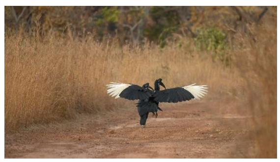
Abyssinian Ground Hornbill