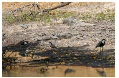
Egyptian Plover, Spur-winged Lapwing, Green Sandpiper

After that we drive to Farafenni to buy water, bread, sardines, corned chicken and a watermelon. We continue east on the North Bank Road. We want to find the Egyptian Plover. This bird is one of the main attractions for birders in The Gambia, I expected to see it when choosing the trip as it is a relatively common bird on sandbanks and river banks in West Africa. At the wetland at Kau-ur we see Collared Pratincole, Ruff, Common Greenshank, and Quailfinch, but no Egyptian Plover. But they are there at a pond near Njau : three Egyptian Plovers. Excellent!