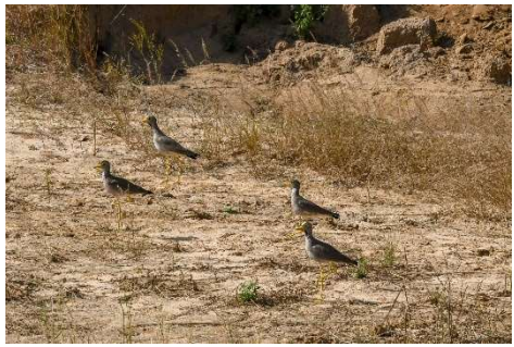
African Wattled Lapwing

After observing the Egyptian Plover we take our lunch break before continuing to Wassu . The stone circles of Wassu belong with other monuments in Gambia and Senegal to the Senegambian stone circles in a so-called megalithic zone, in which in the 7th to 8th century AD a high culture must have existed in West Africa. The stone circles were probably set up for religious burial rituals. The stone circles usually consist of 10 to 25 stone blocks of worked laterite rock weighing between 2 and 10 tons. Although a tomb is associated with each stone circle, the meaning and purpose of the stones is still an archaeologically unsolved mystery. The Wassu Stone Circles have been a UNESCO World Heritage Site since 2006.