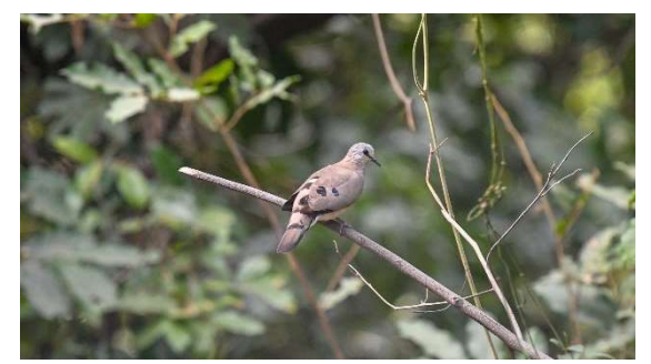
Black-billed Wood Dove