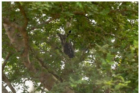
Northern White-faced Owl