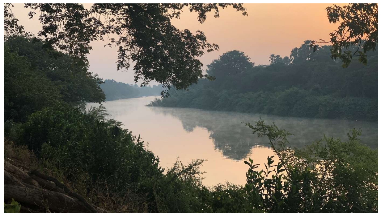
View from Campement de Wassadou

The night was quite cool for Africa, I estimate around 12° Celsius. Fog has formed over the river - unfortunately there are no African Finfoots to be seen. Karanta and Aziz are pretty cold. A coffee helps. Our breakfast at 7:30 a.m. is delicious: baguette, honey and jam - it shows that Senegal was once a French colony.