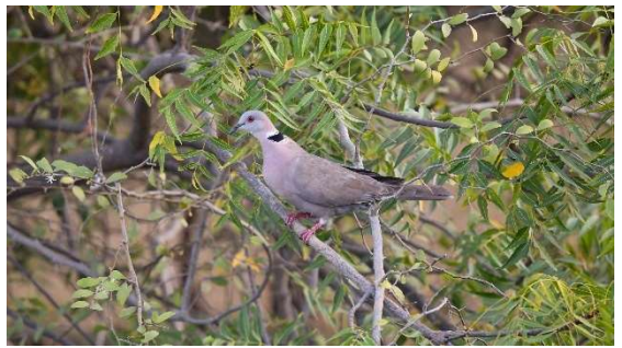
Mourning Collared Dove