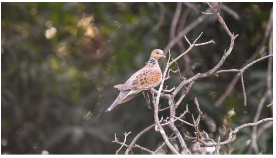
European Turtle Dove

Our two-hour cruise on the Gambia River takes us into a tributary where we see hippos, Guinea Baboons and Western Red Colobus Monkey and lots of birds like Western Red-billed Hornbill, African Darter, Black-crowned Night Heron, Long-crested Eagle, Palm-nut Vulture, and European Turtle Dove.