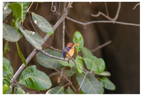
African Pygmy Kingfisher

In the afternoon we drive again to the Tanji Bird Reserve right on the coast to track down the Western Bluebill. Tanji Bird Reserve Eco-Tourism Camp also has a bird bath with benches where we see Little Greenbul. The bluebill doesn't show up at the hide, but Aziz spots the bird on the exit! Another Lifer!