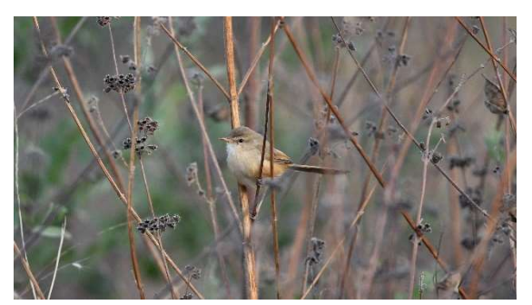
Sahel Bush Sparrow