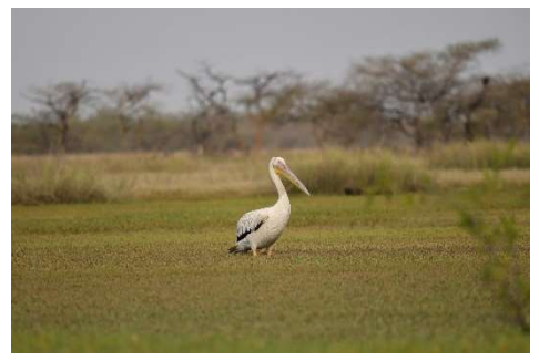
Great White Pelican

Another highlight is coming up: our last boat trip! At 8:30 a.m. we start, across the river Gambia into the mangrove forests on the other side. There is a British couple who also want to see the wildlife without focusing on the birds like we do. But that doesn't matter at all - we are all excited about the abundance of animals. At 220 km<sup>2</sup>, the Bao Bolong Wetland Reserve is the largest protected area in The Gambia and a RAMSAR site of international importance.