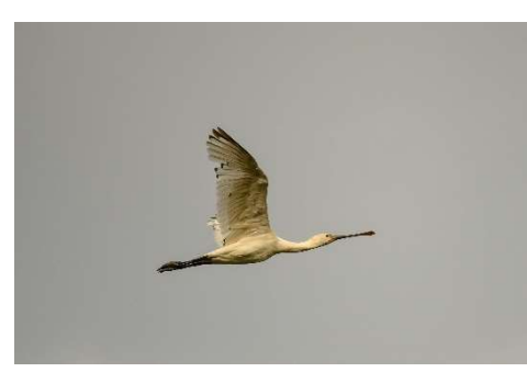
African Spoonbill (juvenile)