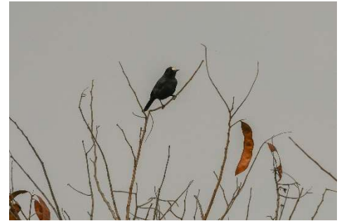
White-fronted Black Chat

The two-hour walk through the area at Jajari was very productive with Gabar Goshawk, Bruce's Green Pigeon, Speckle-fronted Weaver, Yellow-crowned Gonolek, Rufous-tailed Scrub Robin, Brubru, Vieillot's Barbet, Black Scimitarbill, White-fronted Black Chat, and a distant Temminck's Courser.